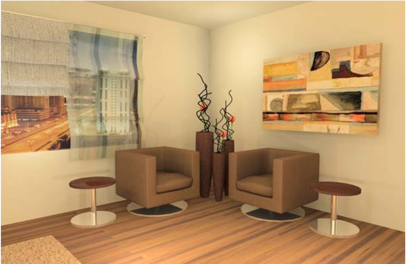
A rendered perspective of the lounge area of a bedroom overlooking a busy city Street. By Pooja

This design was inspired by the growing urban lifestyle becoming increasingly prevalent in Dubai today. This notion is immediately depicted in the scene presented in the window. A bustling, metropolitan and fervent city is vividly visible as a view from the room. Consequently, the furniture that has been designed and used is very modern and eclectic. Most of the design is based on straight, neat lines to accentuate the modernity of the theme and design. Dark brown leather, dark oak and stainless steel form the core of the materials used within the room to represent the young, professional, city lifestyle.